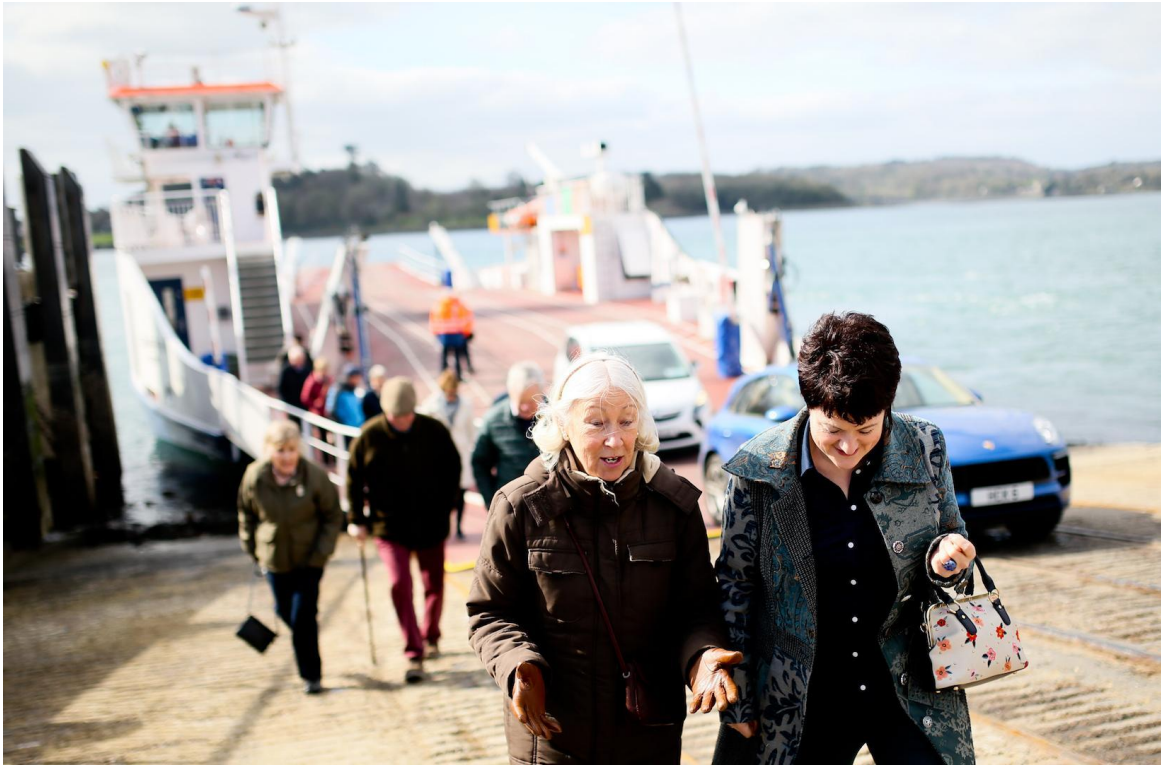
Taking the ferry (above) and Ards Peninsula scenery on the drive from Belfast.